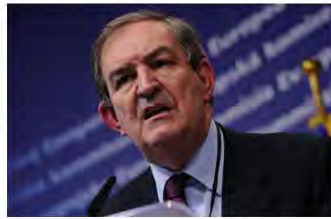
Judge Jean-Louis Bruguiere

Jean-Louis Bruguiere will speak about Terrorist Threats and Judicial Responses to Terrorism in France, especially Mali today. Judge Bruguière was the leading French investigating magistrate in charge of counter-terrorism affairs. He was appointed in 2004 as vice-president of the Paris Court of Serious Claims, Tribunal de Grande Instance .