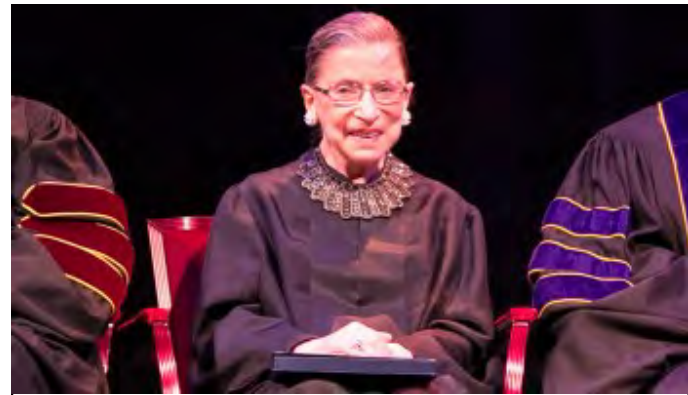
U.S. Supreme Court Associate Justice Ruth Bader Ginsburg

"I am glad to be with you this evening to celebrate Thomas Jefferson's brand-new facility," said Justice Ginsburg. "To make a fine law school, of course, it takes more than just legal state of the art housing and equipment. It takes a dedicated creative faculty – determined to educate students to regard law not simply as a trade but as a public calling." See Justice Ginsburg's Full Remarks