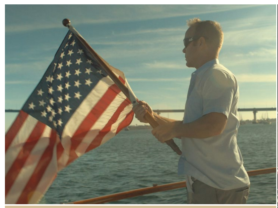
Watch Episode 4 and Read About Eric Bernsen '12