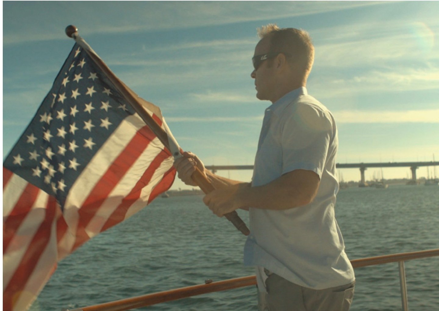
Watch Episode 4 and Read About Eric Bernsen '12