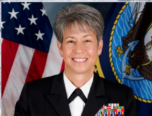
2014 KEYNOTE SPEAKER VICE ADMIRAL NANETTE DERENZI Judge Advocate General, United States Navy

The 2014 Women and the Law Conference gathers together a slate of luminaries in military leadership to explore the unique forces shaping women's access to power in the U.S. military. The conference focuses on a number of issues, including whether new statistics on sexual assault in the military warrant legislative changes to the Uniform Code of Military Justice, and explores the topic of women serving in elite combat units. The conference will be of interest not just to those with a military connection, but to anyone who seeks to gain insight on leadership and success from some of the nation's most powerful lawyers in uniform.