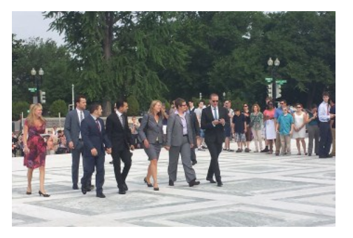
The Prop 8 Plaintiffs Arrive at Court