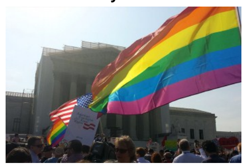
The Crowd Outside the Supreme Court Building