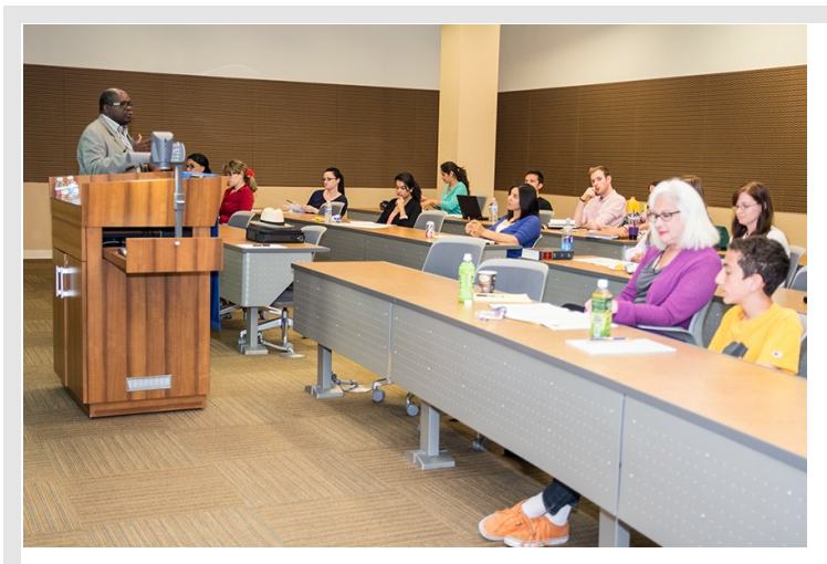
Clinic training held on Tuesday, June 25