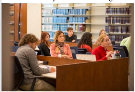
IP Practicum Participants