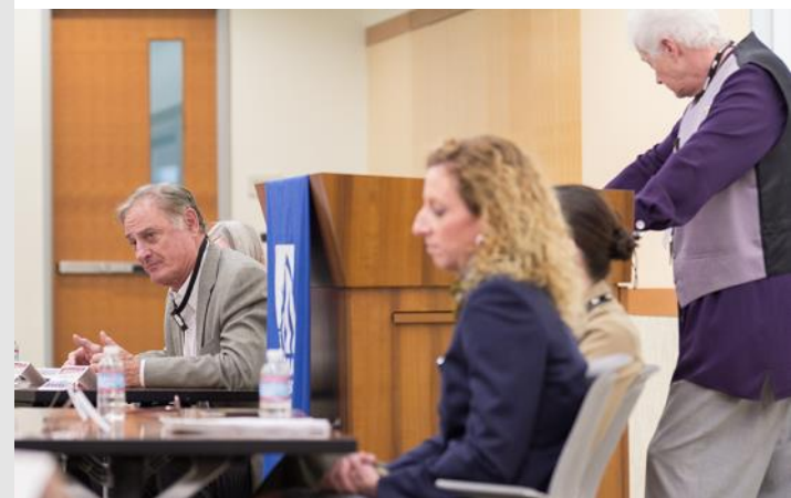
Left: Brigadier General David Brahm

The views expressed by the conference participants do not necessarily reflect those of the Department of Defense or Department of the Navy.