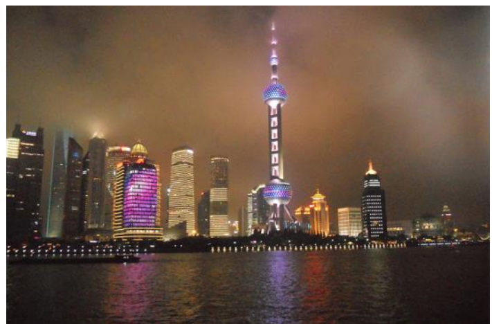
Photo taken by TJSL student Rebecca Mersand of the Shanghai TV tower in Shanghai, China, from the deck of the river boat cruise