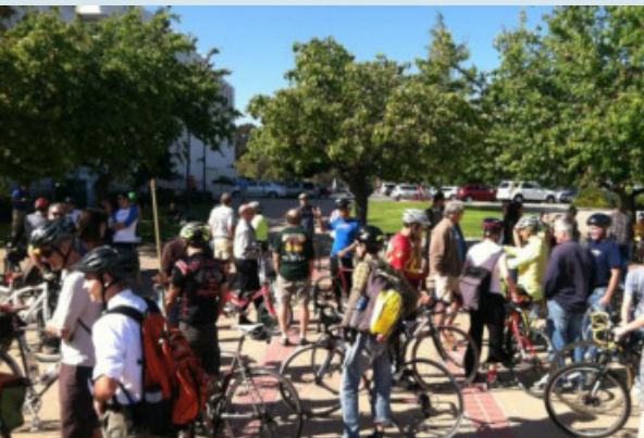
Getting Ready to Ride to the City Administration Building