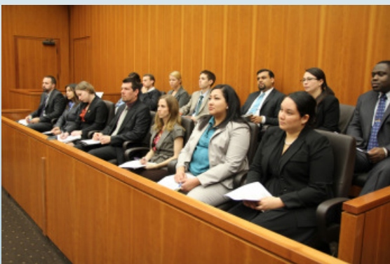
Most of the Students Listened from the Jury Box