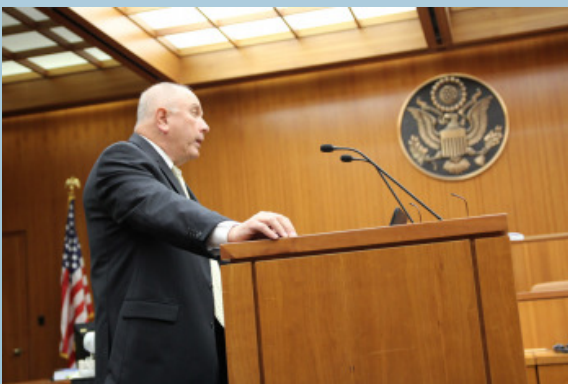
Judge Anthony Battaglia