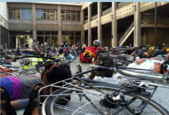
Laying Down Their Bikes at the City Administration Building