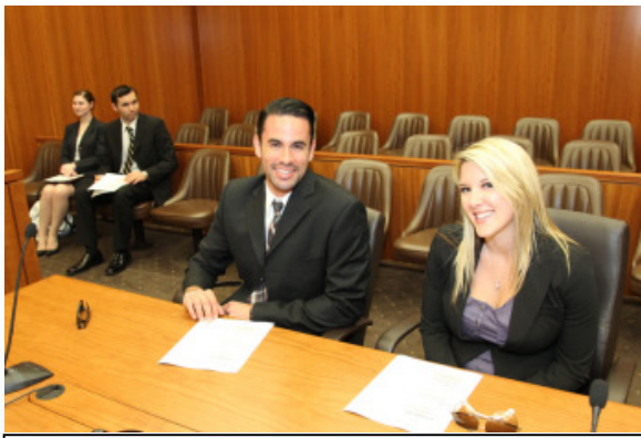
At the Counsel Table