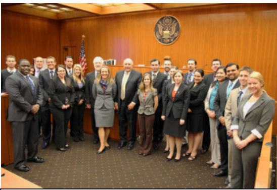
Judge Battaglia (C) with the Federal Civ. Pro. Class

Another part of Rule 3 is to "seek only what you really need, so you don't get mired in too many records." Also, with the sheer amount of electronic files (ESI) nowadays, it can get quite expensive. Rule 4 is to Be A Rules Geek. That means know the rules of discovery and disclosure forward and backward, including the local rules of the district in which the case is being heard. Skipping ahead to Rule 6, it's Be Careful What You Ask For, which is not asking for too much or too little, and getting it in the right format. Electronic files can be so voluminous that they equate to dozens of boxes of paper files.